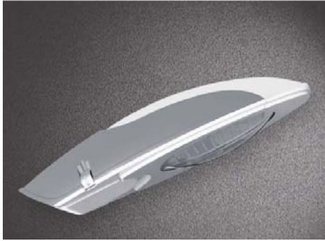
JAL-A type LED fixture