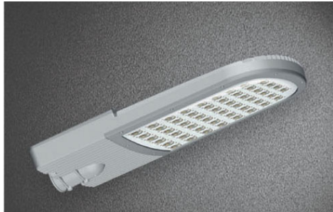
JAL-B type LED fixture