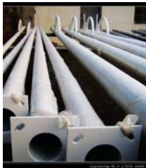
Steel pole + Brackets + cable and accessories